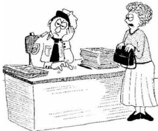
How come it takes you so long to find my car? Kojak used to solve murders in an hour!

1. Which of these people was not a founder of Harley-Davidson? William S. Harley, Arthur Davidson, William A. Davidson or Charles Harley